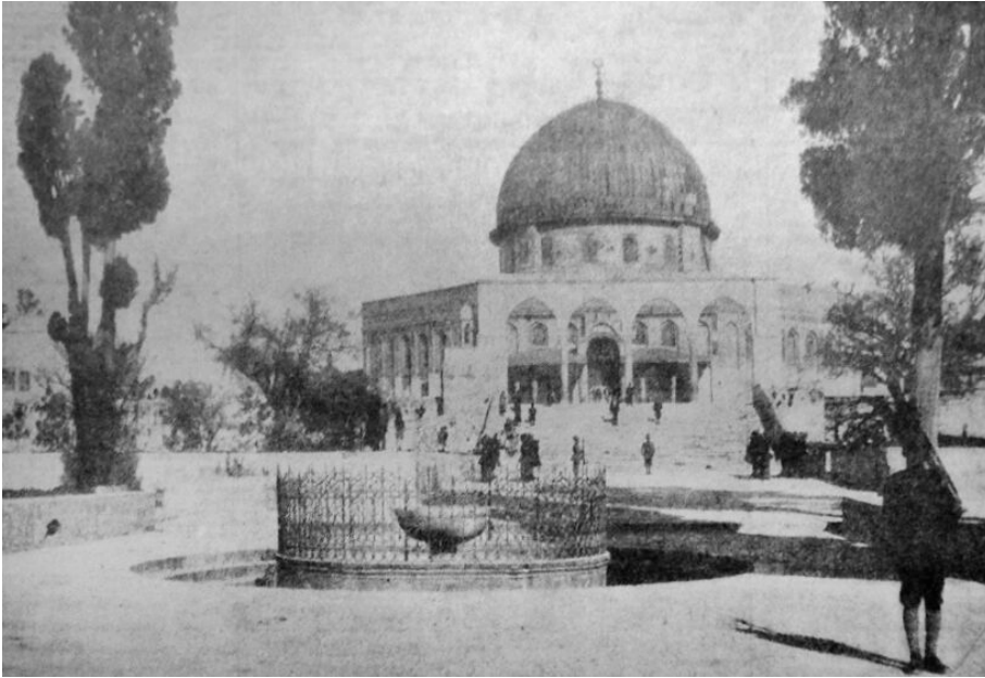
Figure 31.2 Protection of the Mosque of Omar in Jerusalem in 1917 by Muslim troops in the British Expeditionary Force.

Unfortunately, the treaty was not taken up by the majority of the international community: it was only signed by twenty-one states, all in the Americas, and ratified by only ten.