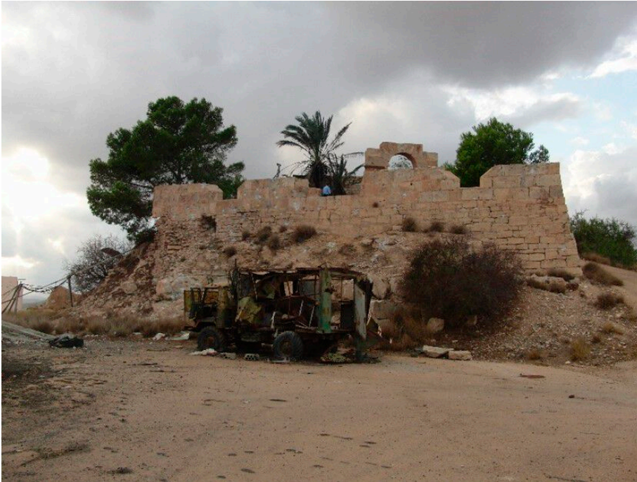
Figure 31.4 Ras Almagheb, Libya, where forces loyal to the government of Muammar Gaddafi stationed six vehicles of a mobile radar/communications unit in the hope they would not be targeted because of the proximity to the Roman fort. All six were destroyed by precision weapons leaving the Roman building intact.

led the organization to commission an internal report, Cultural Property Protection in the Operations Planning Process , published in December 2012, 57 which recommended that NATO construct its own cultural property protection policy. 58 No such policy is yet in place, but a NATO-affiliated “Centre of Excellence” has been suggested that it is hoped will include CPP, and a CPP directive has been approved—the first step to the establishment of policy (fig. 31.4).