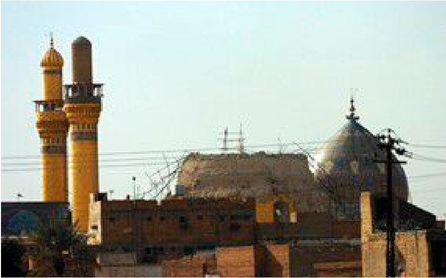
Figure 31.3 The extensive damage to the al-Askari Shrine in Samarra, Iraq in 2006 has been regarded by many as the tipping point that turned general unease with the coalition presence in Iraq into a full scale, sectarian civil war. The minarets were destroyed in 2007.

Very important damage is not restricted to major monuments or national libraries, and destruction impacts every community differently. While the heritage sector and much of the world reacted in horror in 2015–16 to the intentional destruction by ISIS of parts of the World Heritage Site of Palmyra in Syria, for the population of the adjacent town of Tadmur it was almost certainly the destruction of their cemetery, which ISIS forced male members of the community to actually carry out, that had the most telling immediate impact. 44 The use of such forced cultural property destruction as a punishment for minor religious crimes is thought unprecedented. 45 This was a clear demonstration of subjugation, intended to demoralize and emasculate, and had obvious and significant implications for humanitarian assistance once access became possible. The destruction (and looting) of parts of the World Heritage Site may also have a damaging medium- and long-term impact as it will presumably have a serious detrimental effect on the tourist trade, on which most of the local population relies either directly or indirectly.