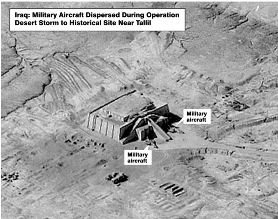
Figure 28.2 Iraqi military aircraft stationed near the Temple of Ur. (US Department of Defense, Conduct of the Persian Gulf War: Final Report to Congress (Washington, DC: Department of Defense, April 1992), https://apps.dtic.mil/dtic/tr/fulltext/u2/a249270.pdf , 133)

justify the risk to the temple, rather than the legal advice they received that Iraq would be responsible for any collateral damage to it. Thus, it was the proportionality rule that created the constraint. According to the report: “While the law of war permits the attack of the two fighter aircraft, with Iraq bearing responsibility for any damage to the temple, Commander-in-chief, Central Command (CINCCENT) elected not to attack the aircraft on the basis of respect for cultural property and the belief that the positioning of the aircraft adjacent to Ur (without servicing equipment or a runway nearby) effectively had placed each out of action, thereby limiting the value of their destruction by Coalition air forces when weighed against the risk of damage to the temple.” 22